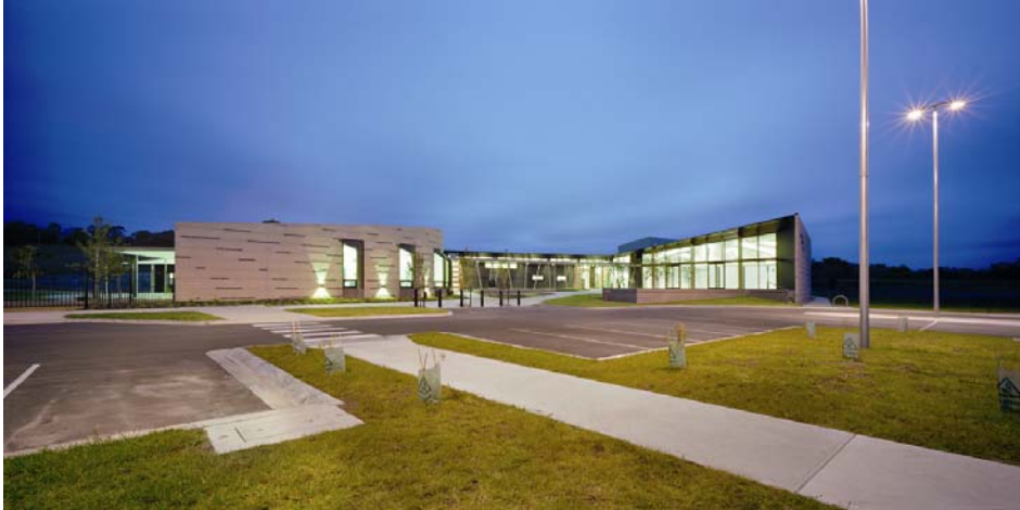
Prior + Cheney Architects - Best Public Project - Beaconsfield Community Complex, Beaconsfield

The new wing is reached along a high ceilinged corridor, which can be blocked off by a wall-sized door. Taking this walk is to leap a century, from the 19th into the simplicity of the 21st.